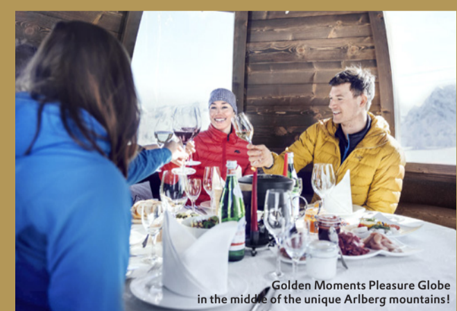
Golden Moments Pleasure Globe in the midst of the unique Arlberg mountains!